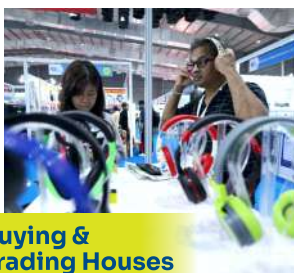
Buying & Trading Houses