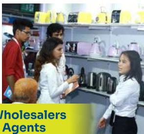
Wholesalers & Agents