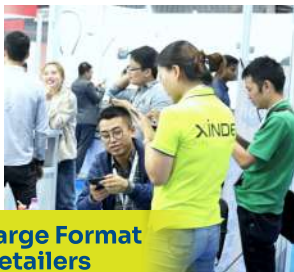
Large Format Retailers