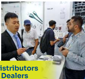
Distributors & Dealers