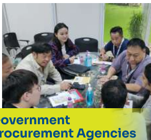
Government Procurement Agencies